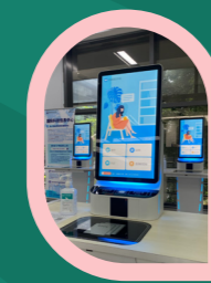
▲ 1F,24Hours Self-service Library