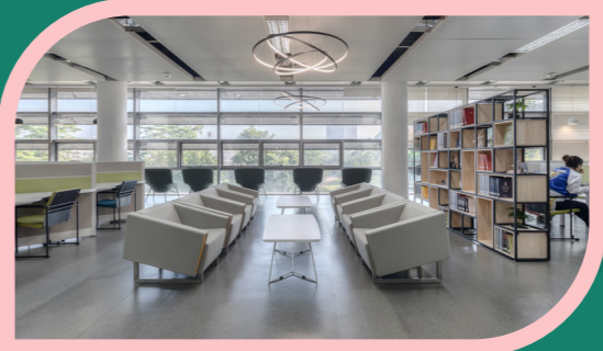
▲ 3F,Reading Area