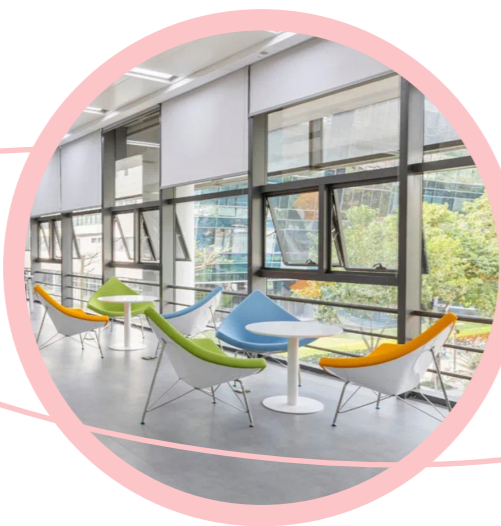
▲ 2F,Reading Area