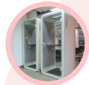
▲ 2F/3F, Single Soundproof Booth